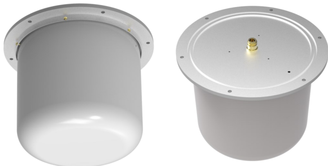
F-3749 Top and Underside View