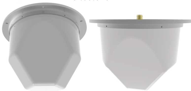
F-3749-B Top and Underside View

Our In-building antennas require a ground plane to work properly. The minimum ground plane size is specified for each antenna. Failure to provide the ground plane may result in poor propagation and/or poor frequency coverage.