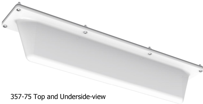
357-75 Top and Underside-view