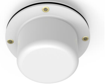
362-75 Top and Underside View