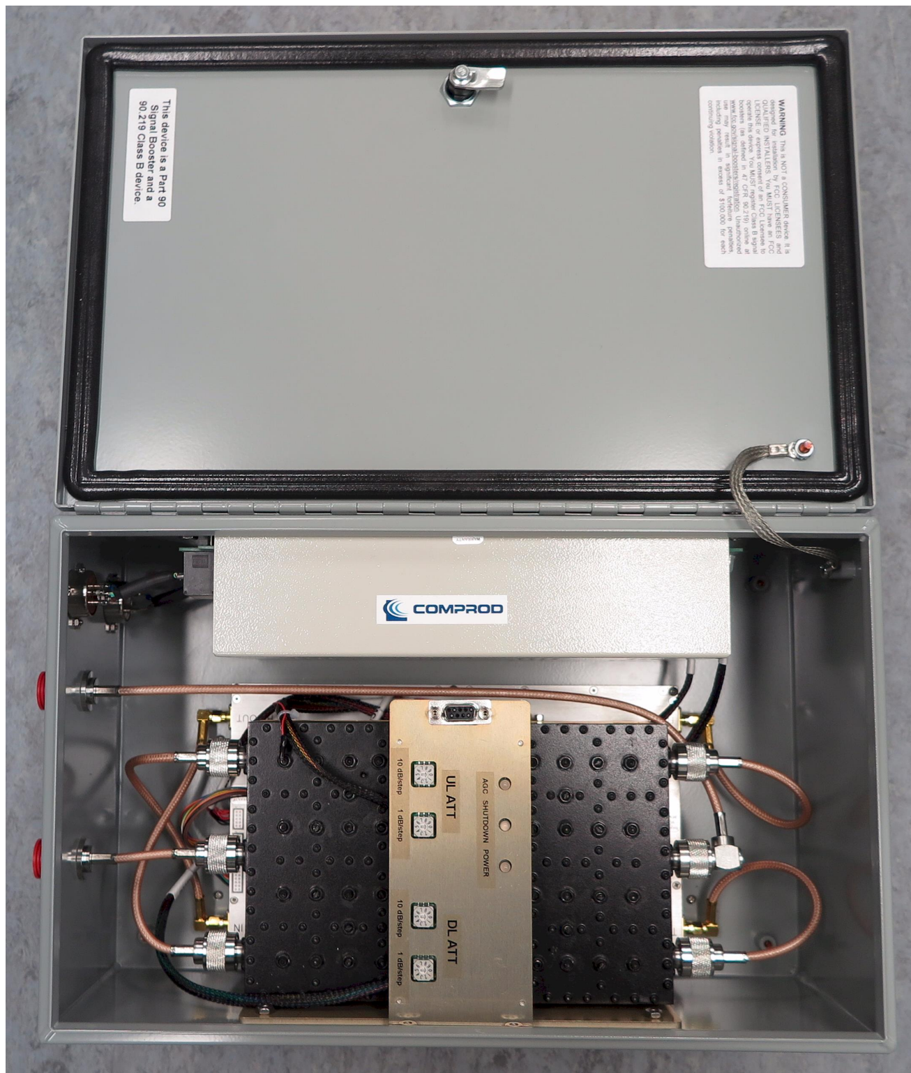
Figure 5: Label position on the BDA

The amplifier unit has its FCC/IC, warning and Signal Booster Class B labels on the front cover, as shown in