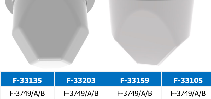
F-3749-B Top and Underside View

Our In-building antennas require a ground plane to work properly. The minimum ground plane size is specified for each antenna. Failure to provide the ground plane may result in poor propagation and/or poor frequency coverage.