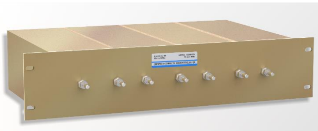
59-13-44 (Fits 3U 19" Rack)