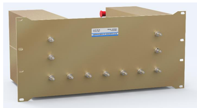
59-13-46 (Fits in 6U 19" Rack)