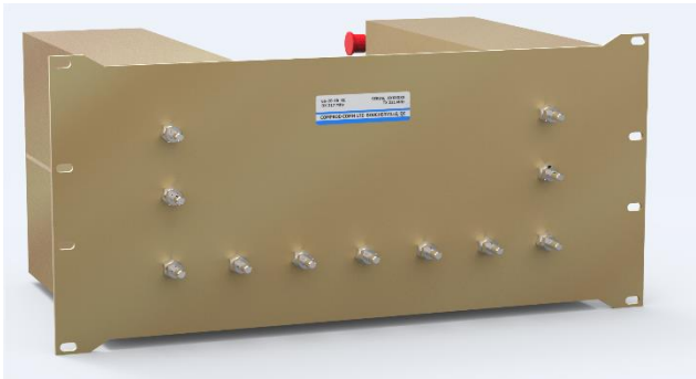
59-13-46 (Fits in 6U 19" Rack)