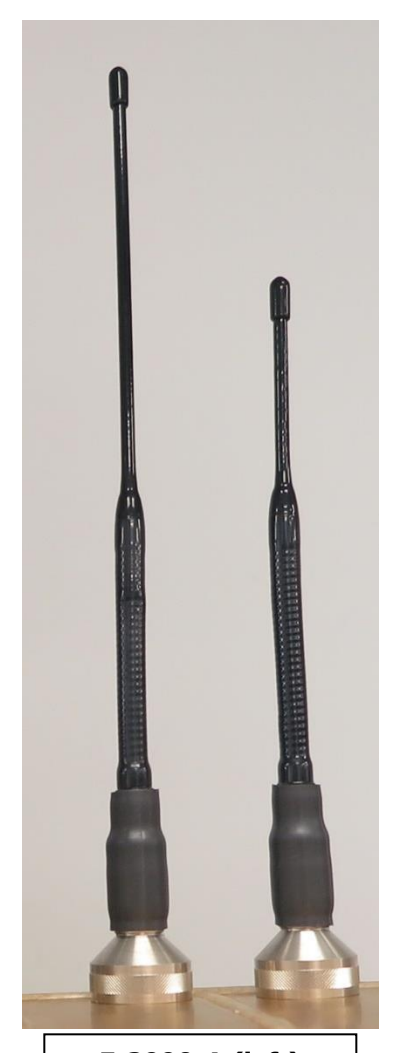
F-3990-A (left) F-3990-B (right)